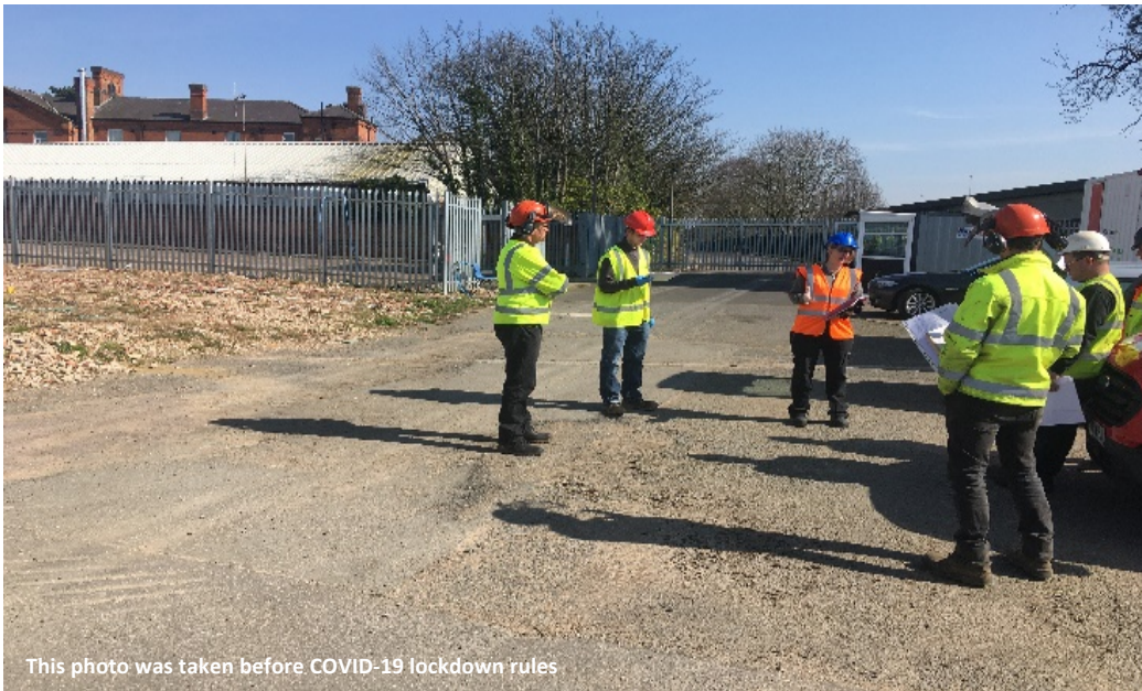
This photo was taken before COVID-19 lockdown rules

We recently carried out early ecology works to manage vegetation across the site to discourage nesting birds and other wildlife, so they are not disturbed by future construction. Pictures of this are below.